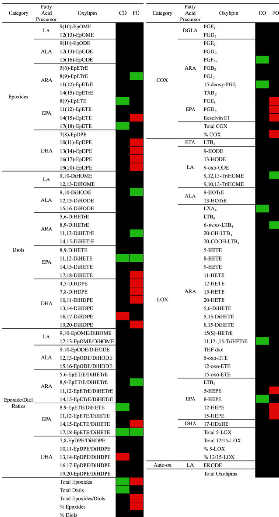
Fig. 3 Heatmap of changes in IgA nephropathy patients supplemented with FO ( n = 7 ) and CO ( n = 7 ) placebo. Data are percentage change from pre- to post-supplementation in each group for each metabolite. If the paired t test was not significant, the squares are black, if the paired t test was significant, the squares are either red (increased) or green (decreased). LA linoleic acid; ALA \alpha -linolenic acid; ARA arachidonic acid; EPA eicosapentaenoic acid; DHA docosahexaenoic acid; DGLA dihomo \gamma -linolenic acid; ETA eicosatrienoic acid (20:3n9); Ep epoxy; ODE octadecadienoic acid; DiH dihydroxy; ODE octadecadienoic acid; ETrE eicosatrienoic acid; ETE eicosatetraenoic acid; DPE docosapentaenoic acid; PG prostaglandin; LX lipoxin; OME octadecamonoenoic acid; LT leukotriene; TX thromboxane; TriH trihydroxy; EPE eicosapentaenoic acid; COX cyclooxygenase; and LOX lipoxygenase (Color figure online)